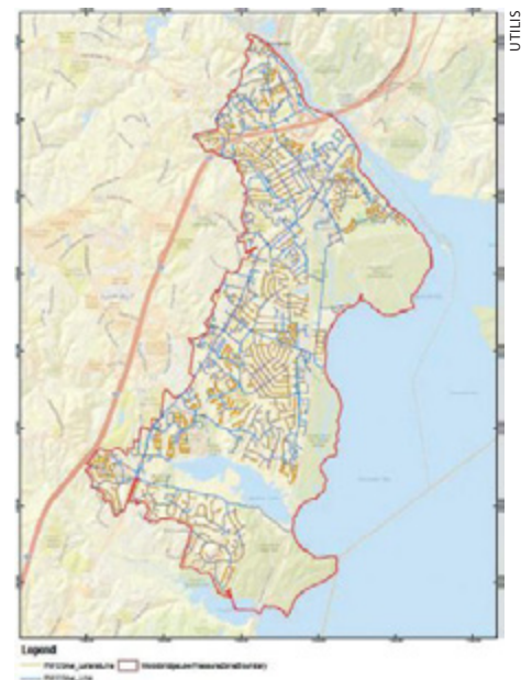
Figure 1. The area of interest evaluated in the pilot test is approximately 200 miles of water main and service pipe.

in a similar manner to the traditional method—using acoustic devices to listen for leaks at appurtenances and then correlating those leak locations. Areas investigated at a POI can be adjusted during the field investigation if the topography warrants. If there is a significant slope, the search pattern may be expanded to check areas uphill of the water plume shown in the satellite imagery. This is intended to increase the potential of locating a leak.